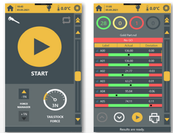
New easy to use touch screen operator interface.