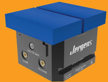
130mm 5-Axis Hydraulic Self-Centering Vise