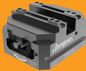
130mm 5-Axis Self-Centering Vise