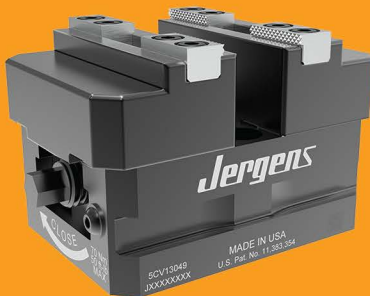
75mm 5-Axis Self-Centering Vise

Quick-change jaws incorporate a pull down feature to actively minimize jaw lift!